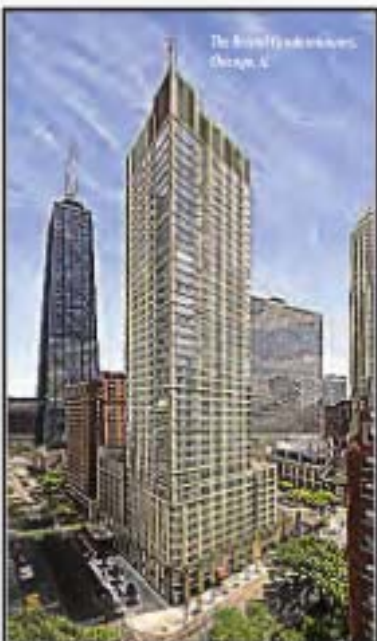
The Bristol Condominium, Chicago, IL